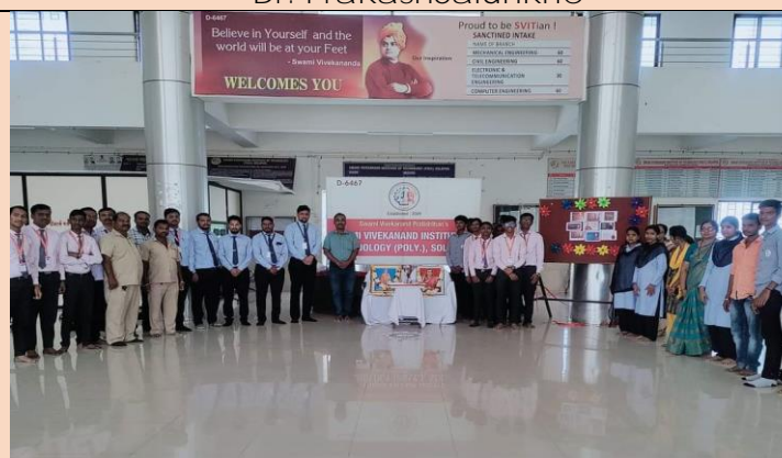
National Youth Day Celebration. (12 th Jan, 2023)