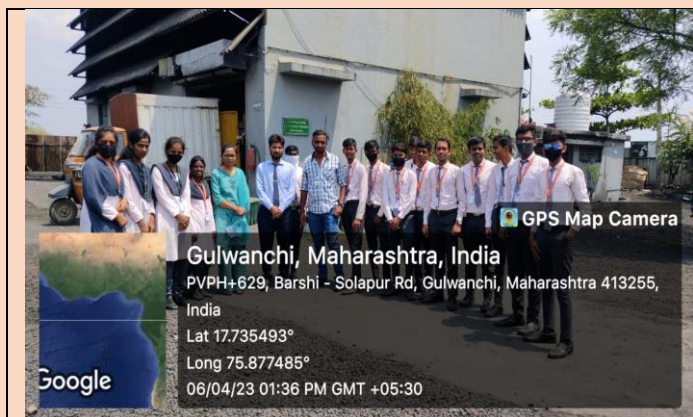
Industrial Visit at Bio Medical waste.