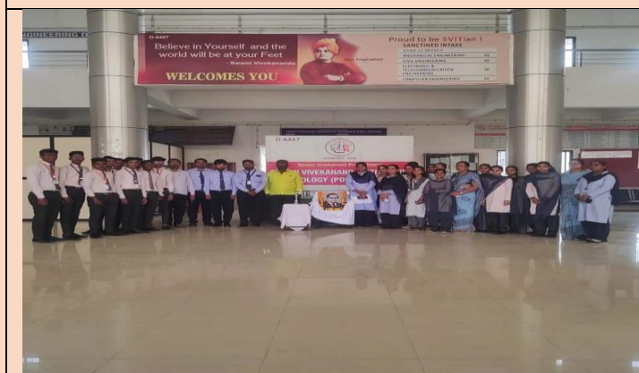
Dr. BabasahebAmbedkarJayanti Celebration. (14 th April, 2023)